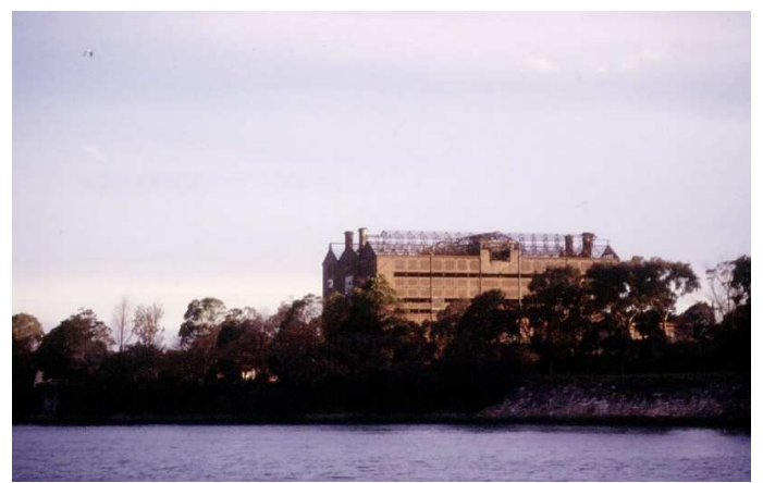
Industrial Landscape, Sydney 2000 (a.p.)

Twigg supports the idea that such spaces are uncanny. He suggests that there is a seductive melancholy associated with dereliction, where absence and presence highlight the disunity between the homely and the unhomely. He reiterates Freud's argument that 'the uncanny is something which ought to have remained hidden but has come to light' (Freud, trans 1985). In this context, derelict urban spaces imply failure, so by rapidly replacing them with new apartments and places of spectacle communities erase uncomfortable memories of such a collapse.