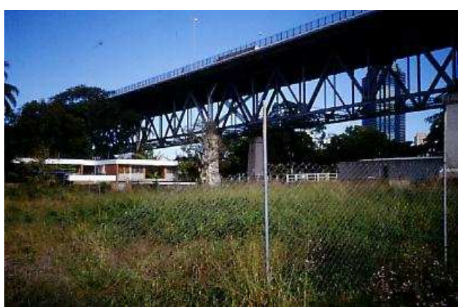
Urban Void, Brisbane, 2000 (a.p)

How can such urban development be tempered so that complex land-uses can co-exist, including the urban voids; those messy, unkempt, apparently unused places which are so important to the patina of our cities?