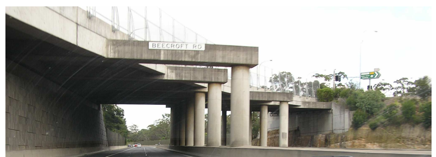
Motorway, Sydney, 2005 (a.p.)

He conducts two-day tours through the bleak periphery of Cologne, where he tries to convey to local people the beauty of discontinuity in these areas. Regularly dissected by motorways and other infrastructure, they can result in surprisingly rich experiences of space.