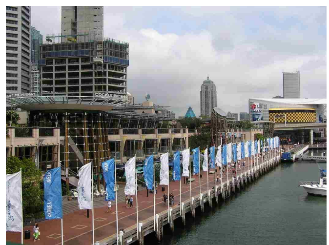
City of Spectacle: Darling Harbour, Sydney, 2005 (a.p.)

and commodification in 21<sup>st</sup> century cities (Harvey,2000). In Sydney, this is particularly evident where vast swathes of former waterfront industrial land are transformed into high-rise housing, waterfront restaurants and tourist facilities.